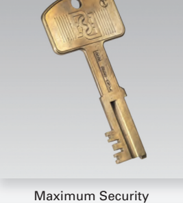
Door Lock Key