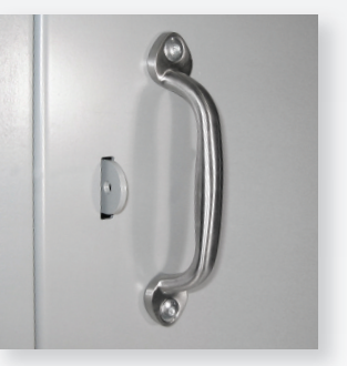
Pad Lock Door Hasp