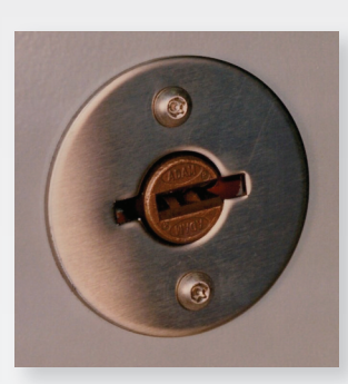
Escutcheon for Maximum Security Lock