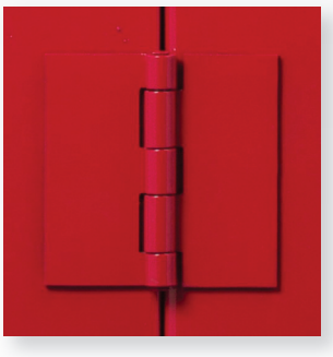
Model 850T Security Hinge