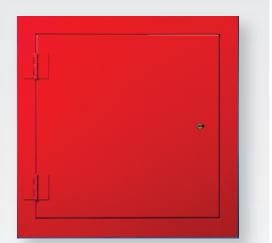
Maximum Security Hose Cabinet

10 ga. FULL METAL adjustable fronts. Reinforced door, 1/4" return on door - grey powder coated paint Hinges: Model 850T security hinge