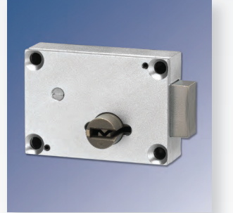
Model 7010 & 7017 Max Security Deadbolt Lock