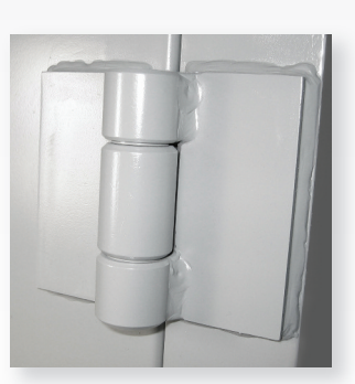
Model H2301D Maximum Security Hinge