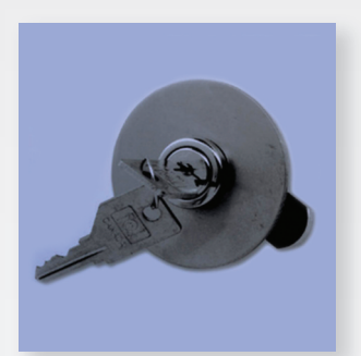
Model 151 Cylinder Lock