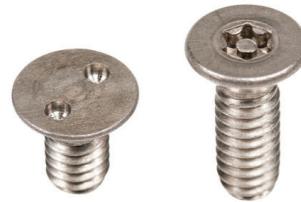
WB 506 TAMPER PROOF TORX AND SNAKE EYE SCREWS