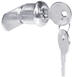
WB 504 STANDARD CYLINDER LOCK (151 KEYCODE)