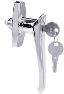
WB 511 L TYPE CABINET HANDLE (151 KEYCODE)