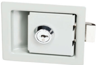
WB 512 ULTRA KEY LATCH (151 KEYCODE)