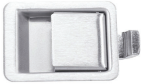
WB 500 MEDIUM PADDLE LATCH