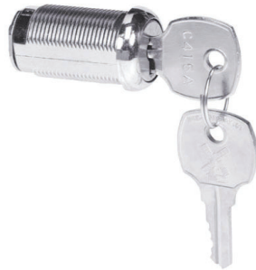
WB 505 MEDIUM BARREL CYLINDER LOCK