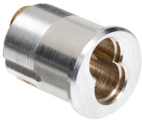
WB 508 MORTISE CYLINDER CORE