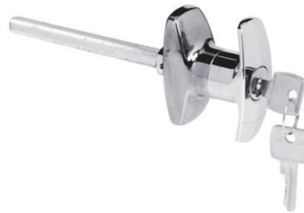
WB 510 T TYPE CABINET HANDLE