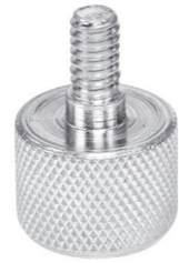
WB 503 KNURL KNOB FOR FR STANDARD AND FR BASIC DOOR