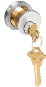
WB 507 E SERIES MORTISE BODY WITH CHANGEABLE CORE